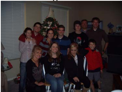
An Arizona Christmas