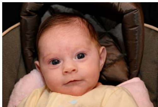
Most Photographed Baby of the Year!

Well, that's all for this newsletter. Look for the next one in July. Until then, take care, stay safe and keep in touch!