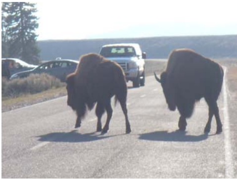
Real live traffic stoppers!