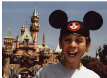
It really is the happiest place on earth! \