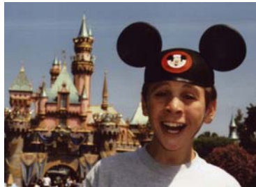
It really is the happiest place on earth! \