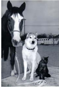
Monet, Nick & Argo

Well, welcome once again to the ever popular Canine Corner!