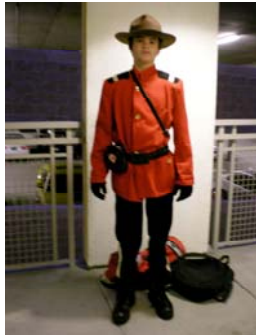
Brooks on Halloween I feel safer already!