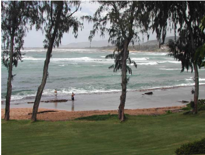
View from our balcony in Kauai....priceless