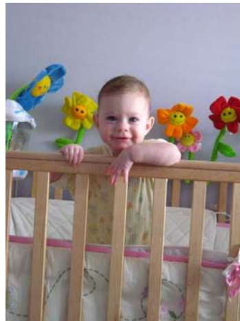
Good Morning Sunshine!