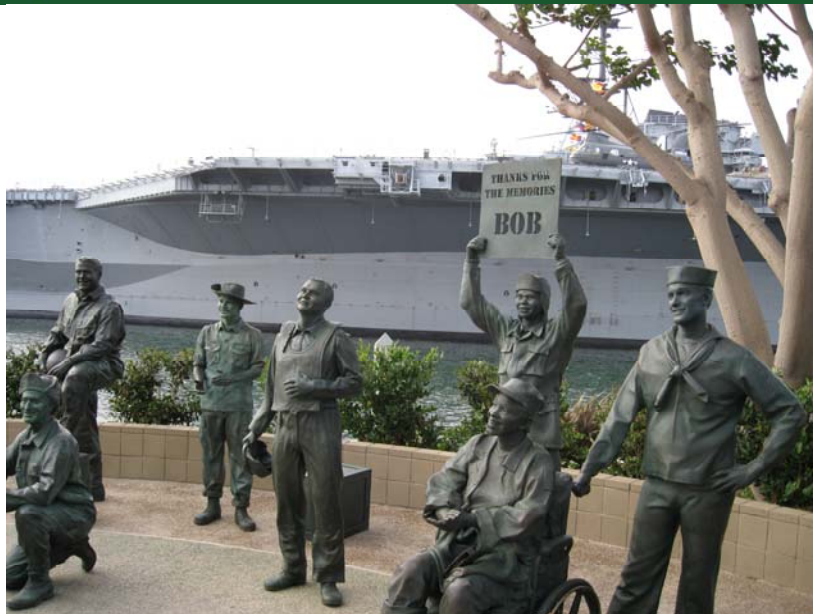
Bob Hope Memorial in San Diego (U.S.S. Midway in background)