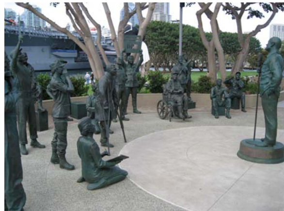
Another view of Bob Hope Memorial

Just wanted to share these photos we took this summer at the Bob Hope Memorial by the U.S.S. Midway carrier in San Diego. It is really a nice tribute to Bob Hope and all our veterans and current service men and women.